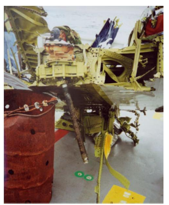
Figure 2: Trim spindle acting as single load path for the THS pitching moment (Alaska Air)

It is not logical to analyse the attachment brackets of an actuator in much greater detail than the actuator itself, if both together create a significant load path. There are several cases of actuator failure due to corrosion, that would have been easily predictable, if the structures analysis logic and the structures rating system would have been applied. The same applies to actuators failing due to fatigue cracking.