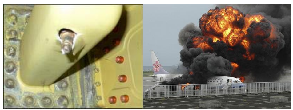
Figure 3: Structural failure of a slat track can resulting in a fuel leak

Although not carrying loads, some parts of the structure build the boundaries of fuel tanks, hence their structural integrity is essential for preventing fuel leaks, which meet the safety definition of MSG-3. The Slat Track Cans are one good example for such structural items, which recently caused a hull loss, narrowly avoiding multiple fatalities. Note: This specific accident was caused by AD to the slat track can caused by a system failure, but the same result could have happened due to undetected corrosion within the can.